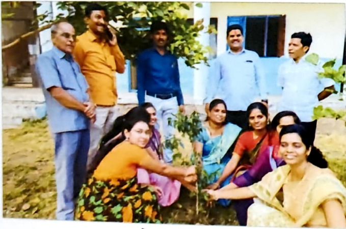
वृक्षरोपन व संवर्धन