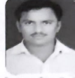
Karale A.D ( 2021-22 )