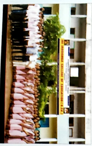
बी.एड. बॅच (२०२२-२३) प्रशिक्षणार्थी