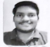
Gund P.D ( 2022-23 )