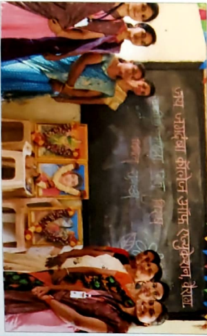
महिला दिन साजरा करताना बी.एड. प्रशिक्षणार्थी