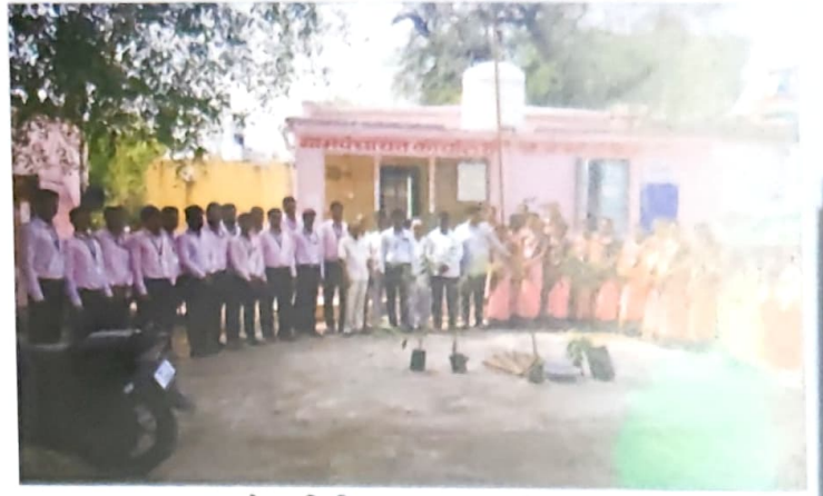
समाजसेवा शिबिर २०२३, सुर्डी, ता. चार्शी