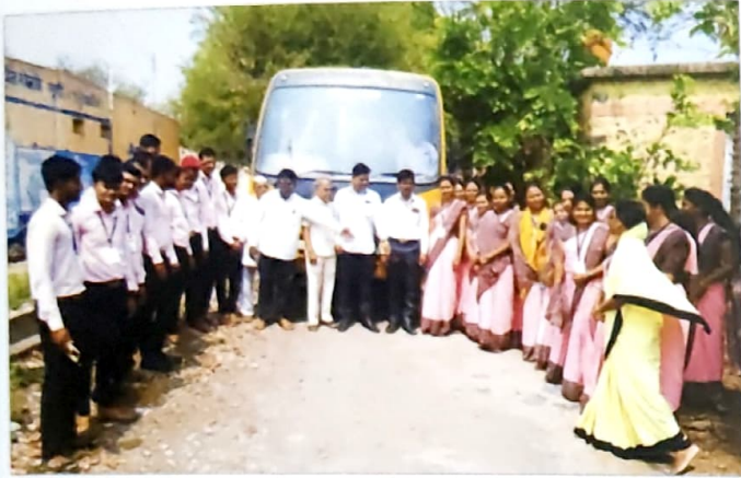
एकदिवशीय शैक्षणिक सहल २०२२