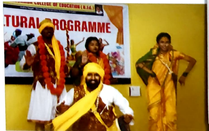
सहभागी प्रशिक्षणार्थी बी.एड. बॅच २०२३-२५