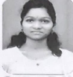
Sutar B.V ( 2022-23 )