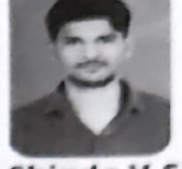
Chipde V.S ( 2021-22 )