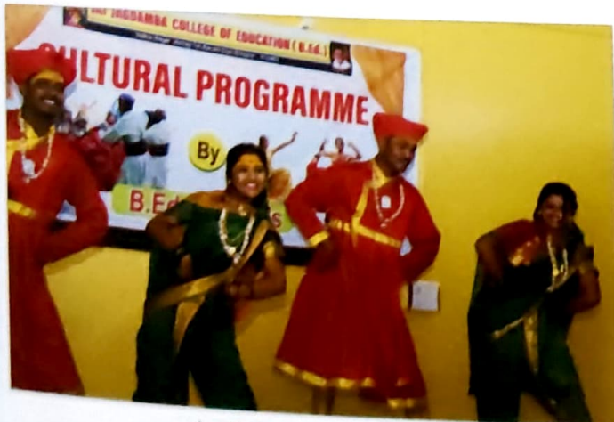
सांस्कृतिक कार्यक्रम २०२४