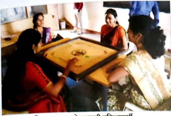
क्रिडा सप्ताहामध्ये सहभागी प्रशिक्षणार्थी