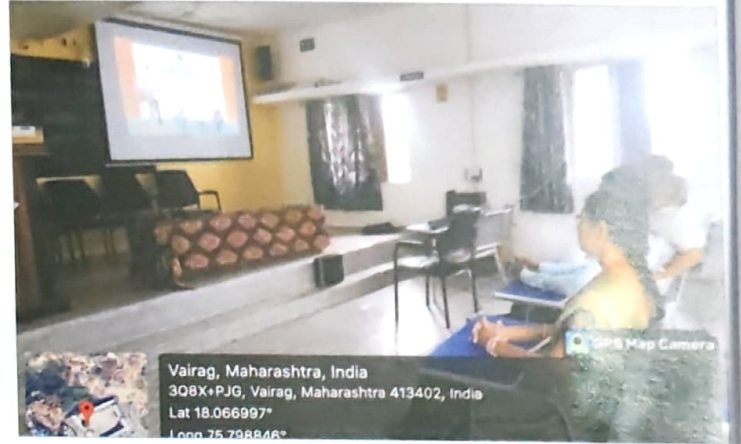
व्हीडीओ कॉन्फरन्स द्वारे अध्यापन