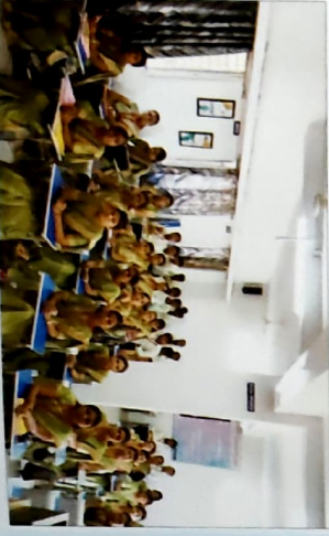
चर्चा सत्रात सहभागी बी.एड. प्रशिक्षणार्थी