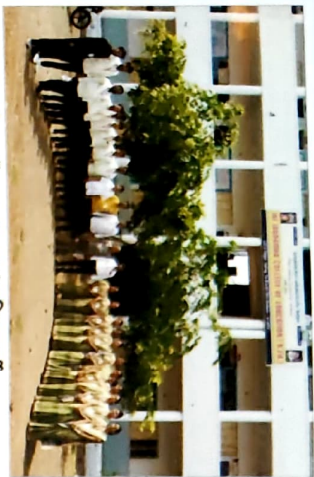
बी.एड. बॅच (२०२३-२४) प्रशिक्षणार्थी