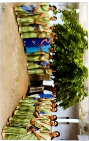
दशपुजन उपक्रम २०२३