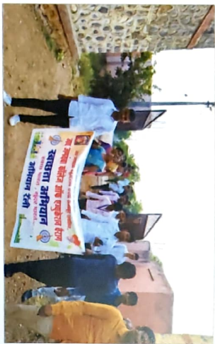
स्वच्छता अभियान रॅली २०२२