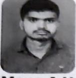
Mane A.V ( 2021-22 )