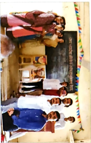
महात्मा पुणे यांची ज्यंती साजरी करताना बी.एड. प्रशिक्षणार्थी