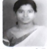
Hulmani S.S ( 2019-20 )